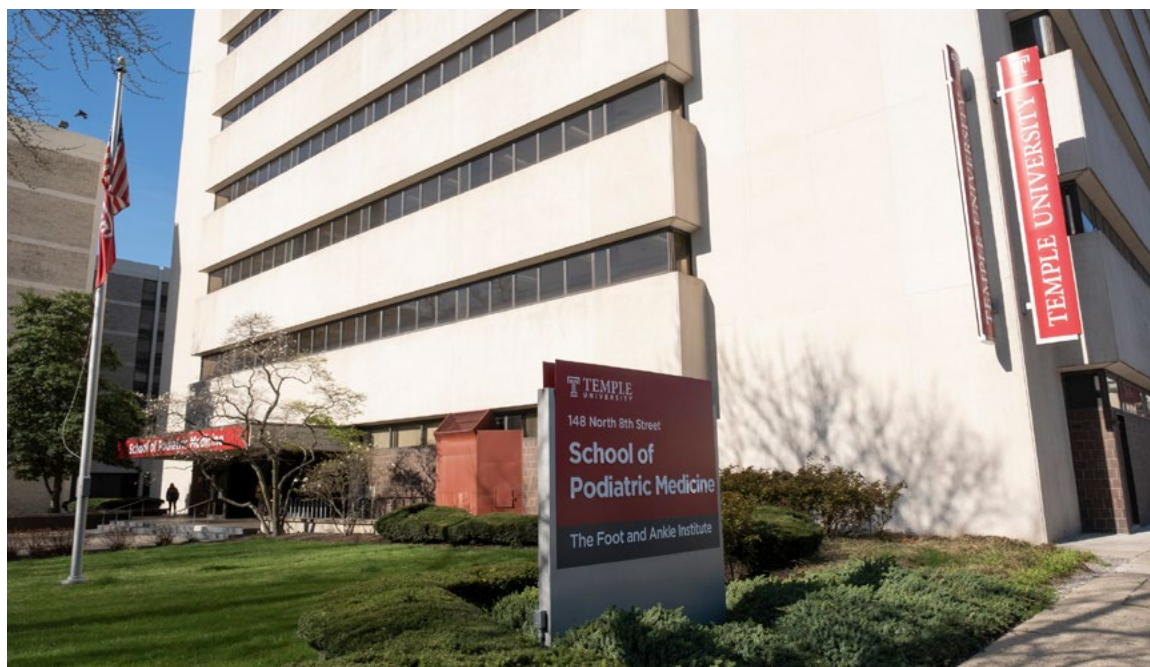
The School of Podiatric Medicine is located at 8th and Race Streets in Philadelphia.

2020 and 2021 crime rates reflect reduction of staff/students due to COVID and subsequent remote learning/work.