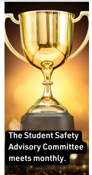
The Student Safety Advisory Committee meets monthly.

Join us as we honor some of our own heroes who made a difference in the lives of those who live and work within the Temple Community!