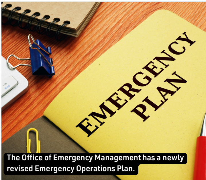
The Office of Emergency Management has a newly revised Emergency Operations Plan.