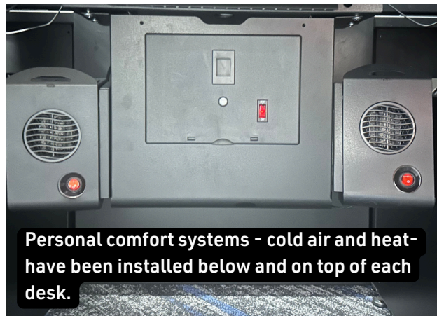
Personal comfort systems - cold air and heat- have been installed below and on top of each desk.

Our team is making amazing progress with the Communication Center enhancement project. We will have a grand reveal in next month's issue of Proud TU Serve , but we are excited to share some key upgrades now that will improve work environment for all of our dispatchers. For instance, each of the dispatcher's desks include