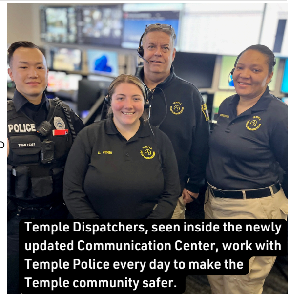
Temple Dispatchers, seen inside the newly updated Communication Center, work with Temple Police every day to make the Temple community safer.