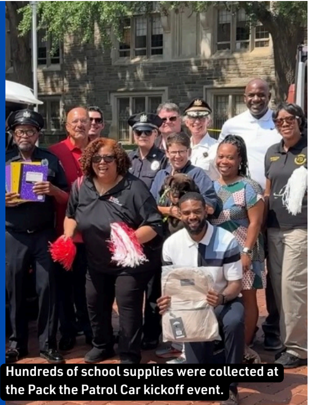
Hundreds of school supplies were collected at the Pack the Patrol Car kickoff event.