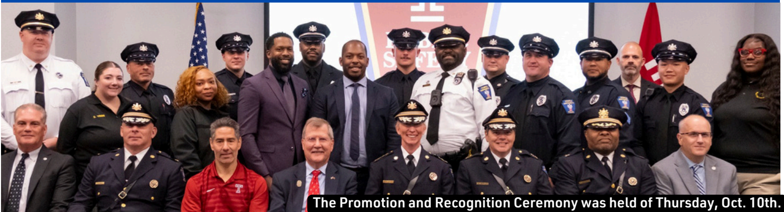
The Promotion and Recognition Ceremony was held of Thursday, Oct. 10th.