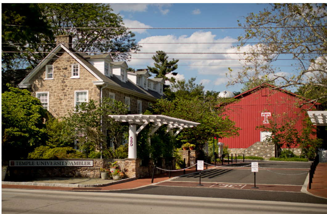
Ambler's Red Barn is an iconic feature of the campus.

These crime statistics include reports from the students, staff, visitors, and those traversing the university area.